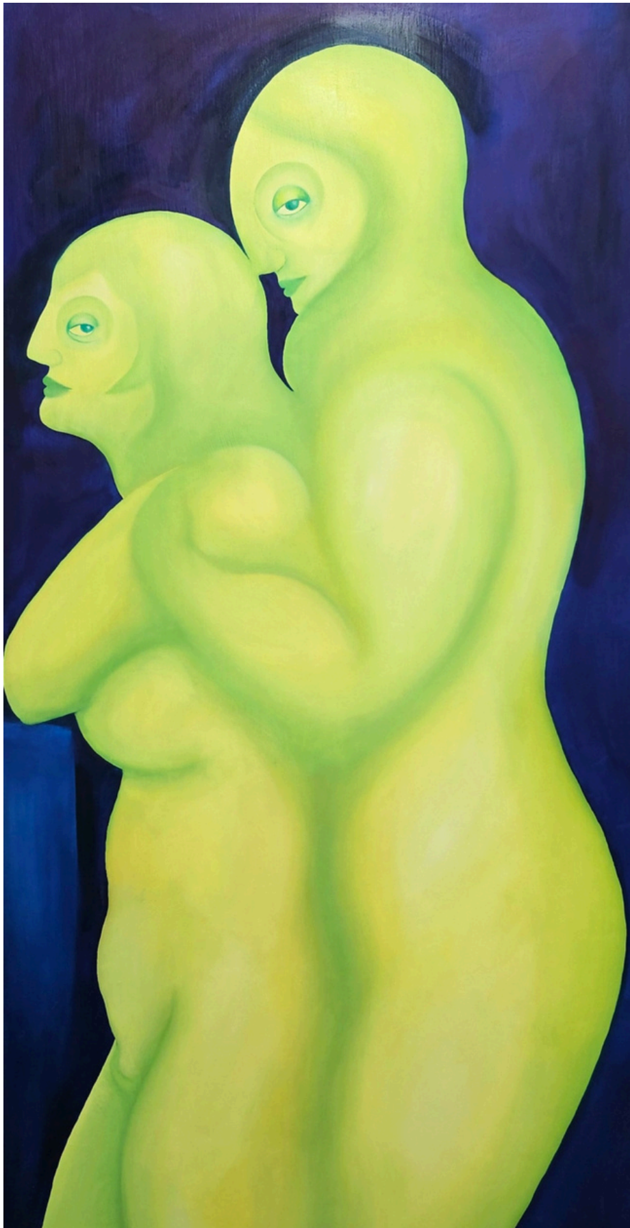
Invert (2026) Oil on canvas, 135 x 64 cm, Between People - Para Shape.