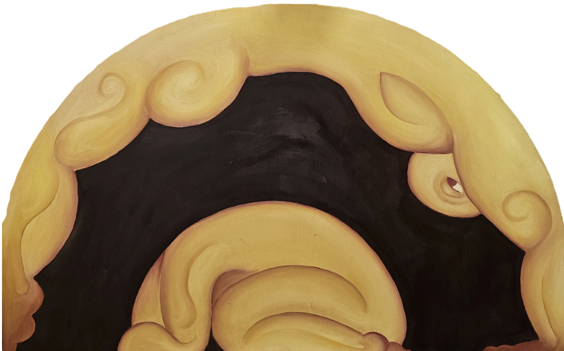
Strong Like Honey (2026) Oil on Wood, 67 x 41 cm, Between People - In Shape