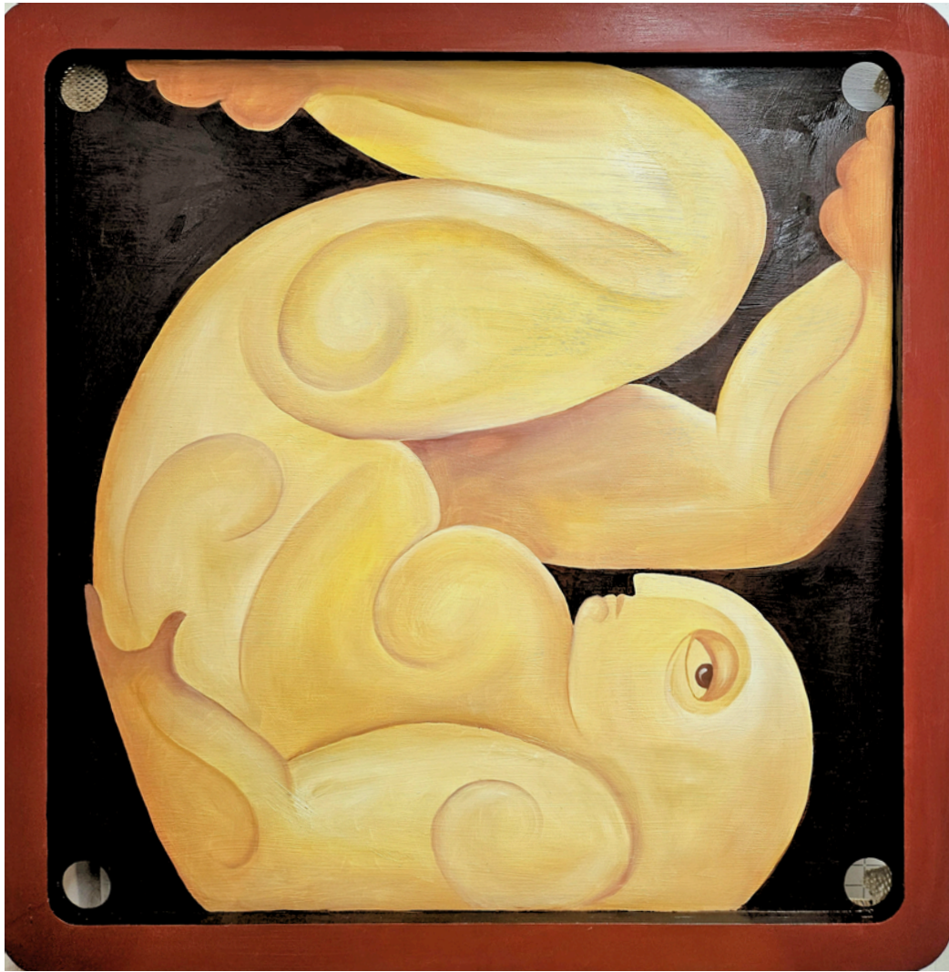
The Contortionist (2025) Oil on Wood, 83 x 83 cm, Between People - In Shape