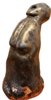
Embrace\ Grieving Figures (2025) Nine piece ceramic series, from 5 x 6 x 3 cm to 17 x 12 x 6 cm, Tower Gallery - Corpus.