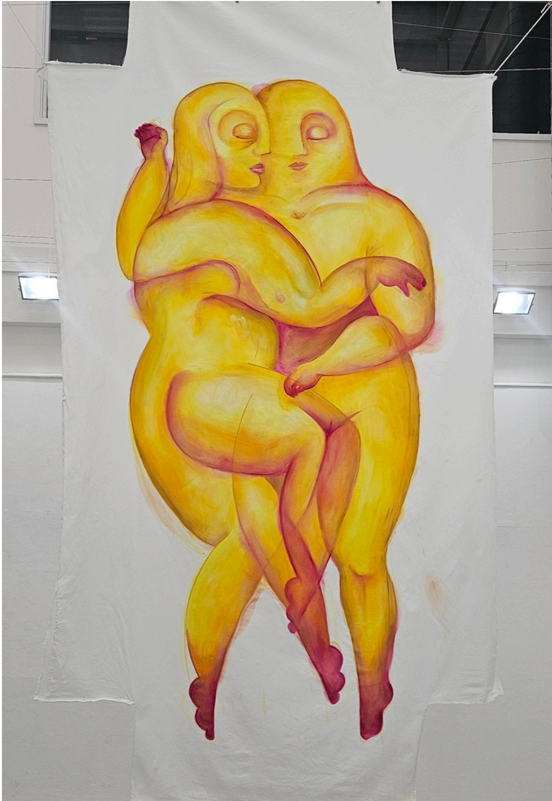
Overlap (2026) Gouache on bedsheet, 250 x 150 cm, Between People Gallery - Rhythms for Reasons.