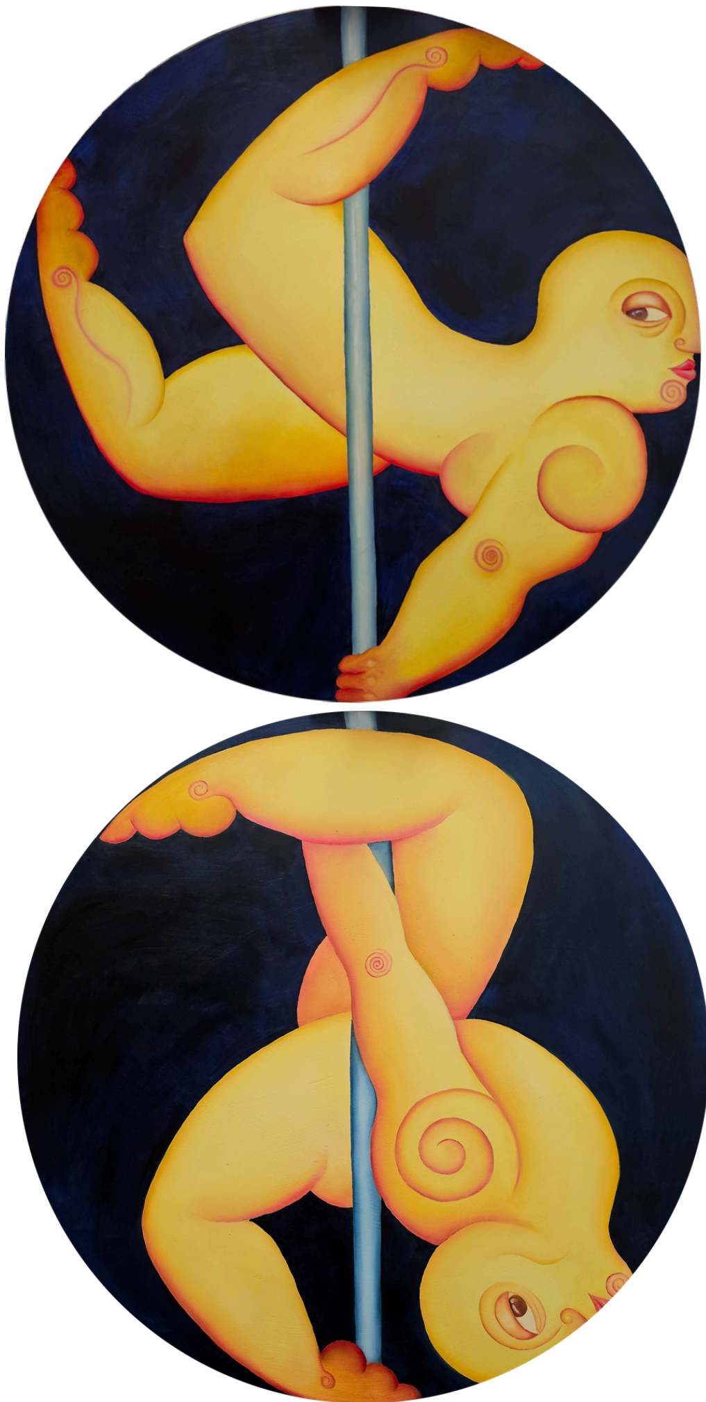
Eros and Helix (2026) Oil on Wood, 65 x 65 cm, Between People - Para Shape.