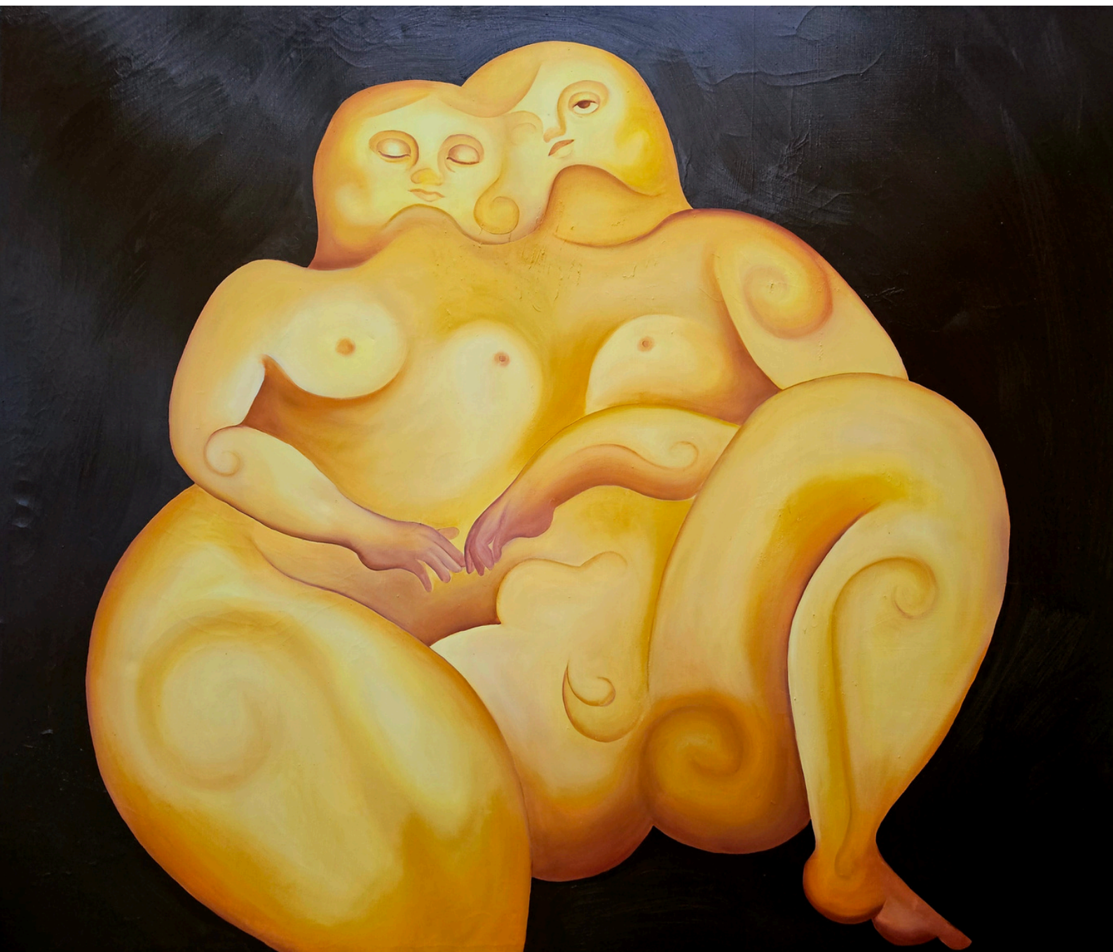
Cyclops (2026), Oil on Canvas, 176 x 137 cm, Tower Gallery - Women by Women.