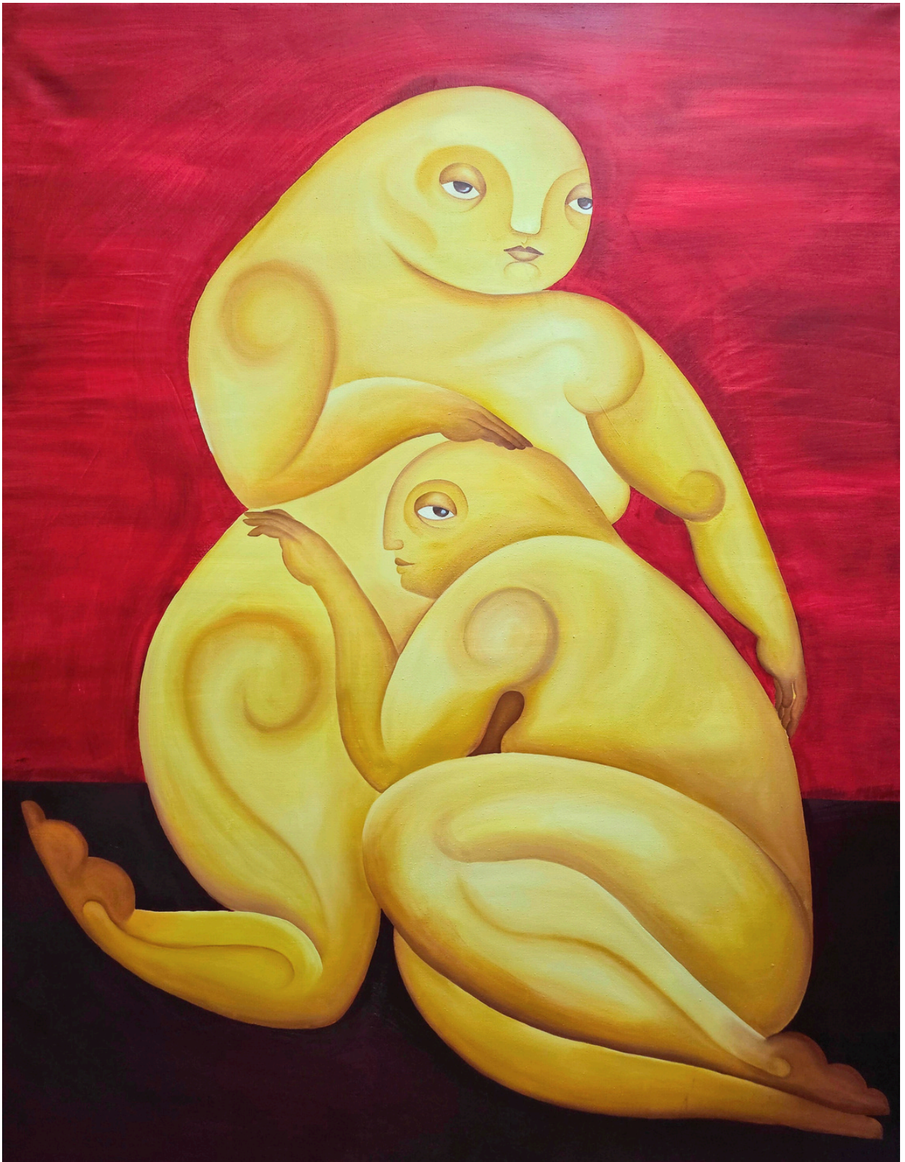
Point of Light (2026) Oil on Canvas, 166 x 128 cm, Between People - Para Shape.