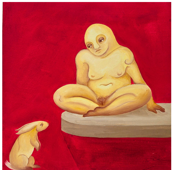
Pole and Bunny Quadtych (2026), Oil on Birch Panels, each 30 x 30 cm, White Lube Gallery.