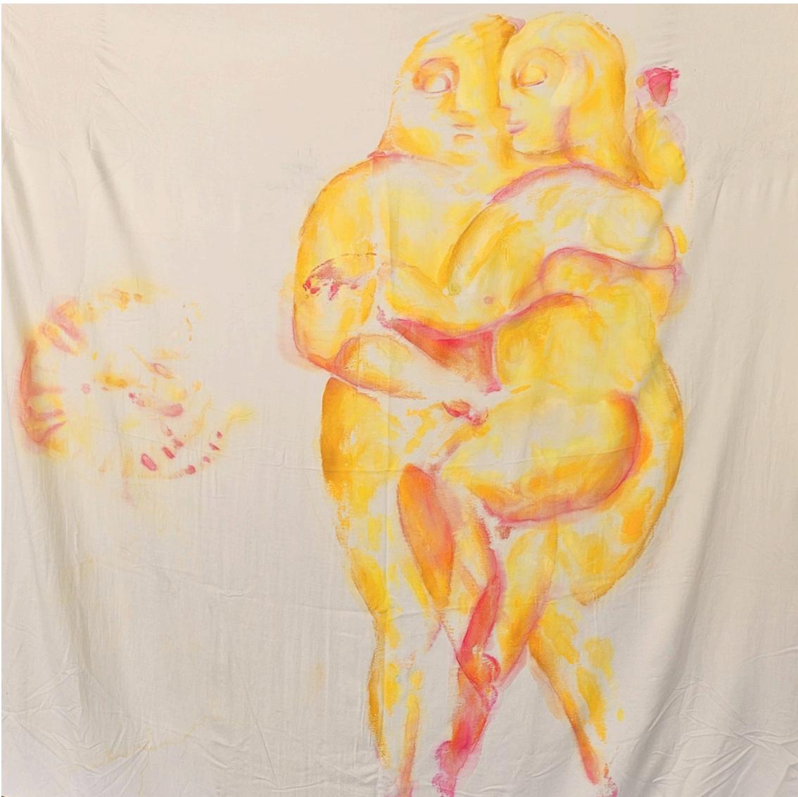
Vestige (2026) Gouache on bedsheet, 195 x 320 cm, Between People Gallery - Rhythms for Reasons.