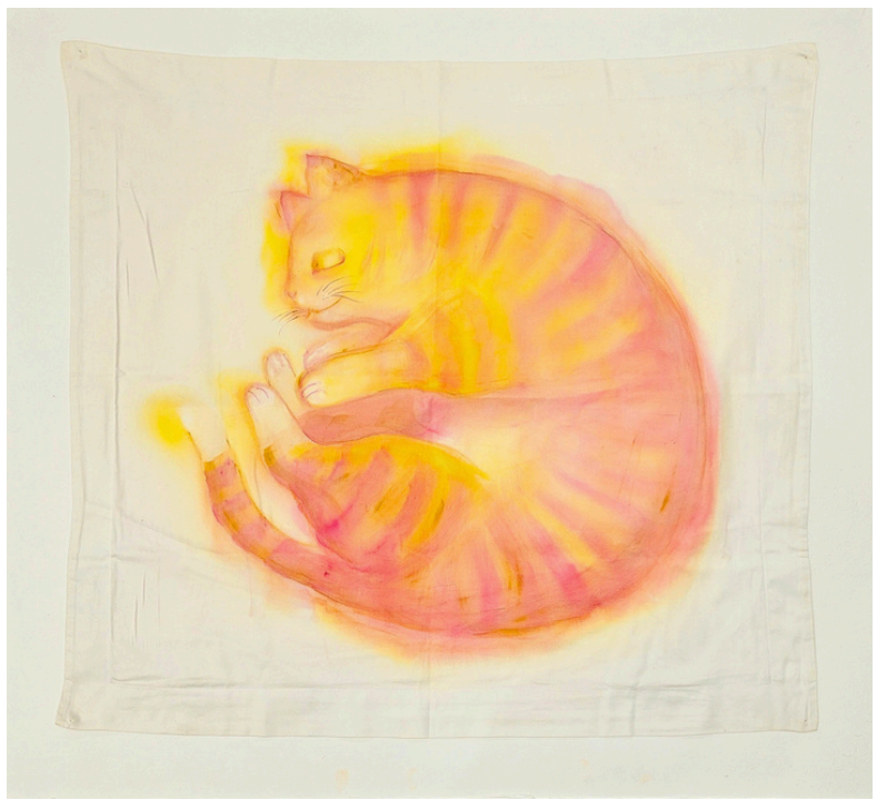
Kleine Katze (2026) Gouache on Pillow case, 85 x 85 cm, Between People Gallery - Rhythms for Reasons.