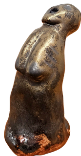
Embrace\ Grieving Figures (2025) Nine piece ceramic series, from 5 x 6 x 3 cm to 17 x 12 x 6 cm, Tower Gallery - Corpus.